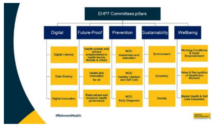
Seventh European Health Parliament key policy topics

Furthermore, to help analyse, understand, and create effective research strategies, building on the ENRF Strategic and Operational Research Plan (SORP) 2021-2024 and the ENRF Policy Briefs, providing an analysis of the policy and research actors and networks in order to influence EU Health Research, the ENRF has been networking and meeting people from the European Health Parliament (EHP) - a movement connecting and empowering the next generation of European health leaders to rethink EU health policies – constituted by a group of 60 young professionals.